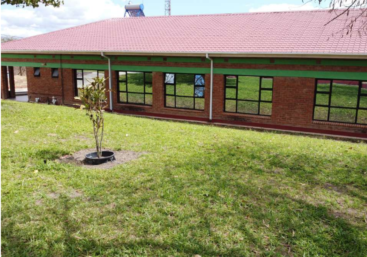
One stop shop: The Students' Service Centre

From inception, the University has been offering undergraduate programmes only but plans to introduce postgraduate programmes are already underway.