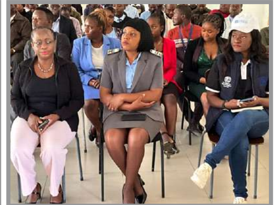
Part of the delegates that attended the launch

Manicaland State University of Applied Sciences recently launched the Community Mental Health Centre in a bid to decentralize the provision of Mental Health Services which are generally found at few psychiatric associations in Zimbabwe.