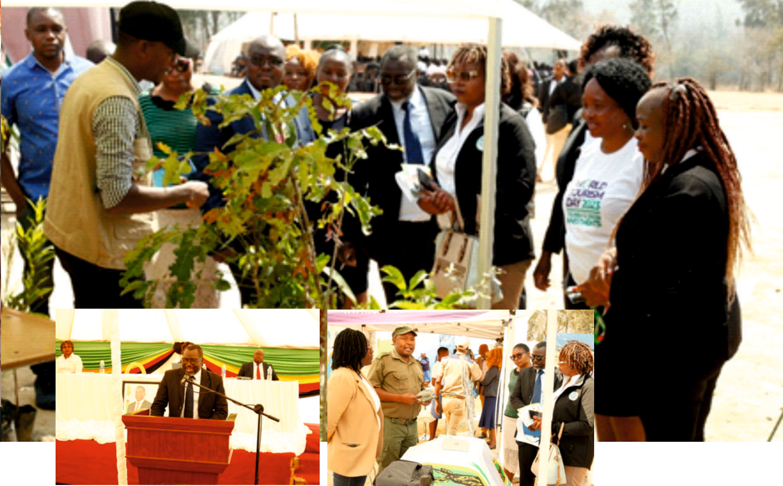
Part of the proceedings at the symposium

“Through the theme for this year, green investments are indeed key for sustainable tourism recovery. I would like to applaud the Ministry of Environment, Climate, Tourism and Hospitality Industry and MSUAS who worked tirelessly to make sure that the event becomes a resounding success. We appreciate the collaboration and we believe such partnerships are important for the nation's growth as we work towards achieving vision 2030,” he said.