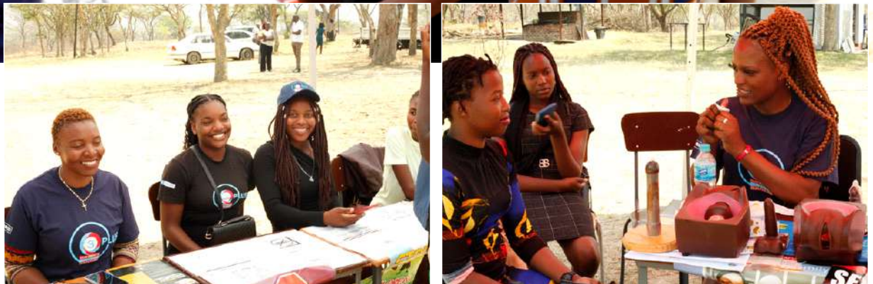
Part of exhibitors at the Health Fair