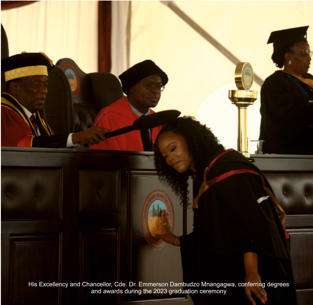
His Excellency and Chancellor, Cde. Dr. Emmerson Dambudzo Mnangagwa, conferring degrees and awards during the 2023 graduation ceremony