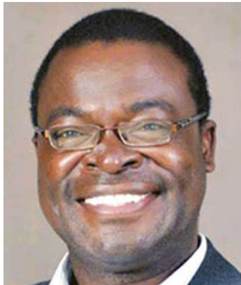
The Minister of Higher and Tertiary Education, Innovation, Science and Technology Development Prof. (dr.) A. Murwira