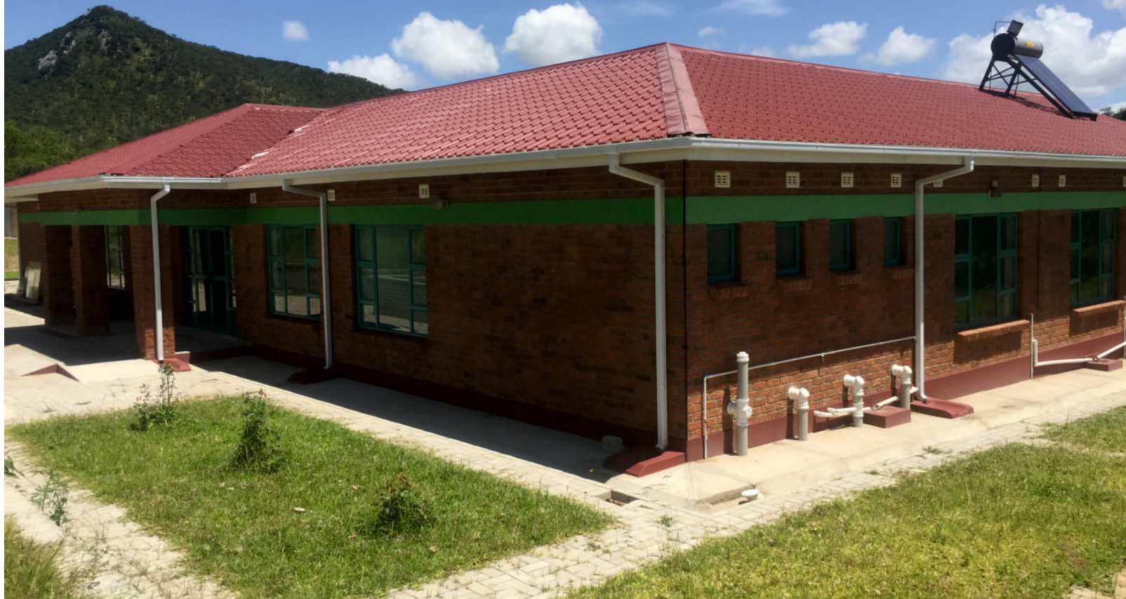
The Health Services Centre which houses the Mental Health Services Centre

“Today, we are not only celebrating the opening of a physical space but also breaking down of barriers and the destigmatization of mental health.”