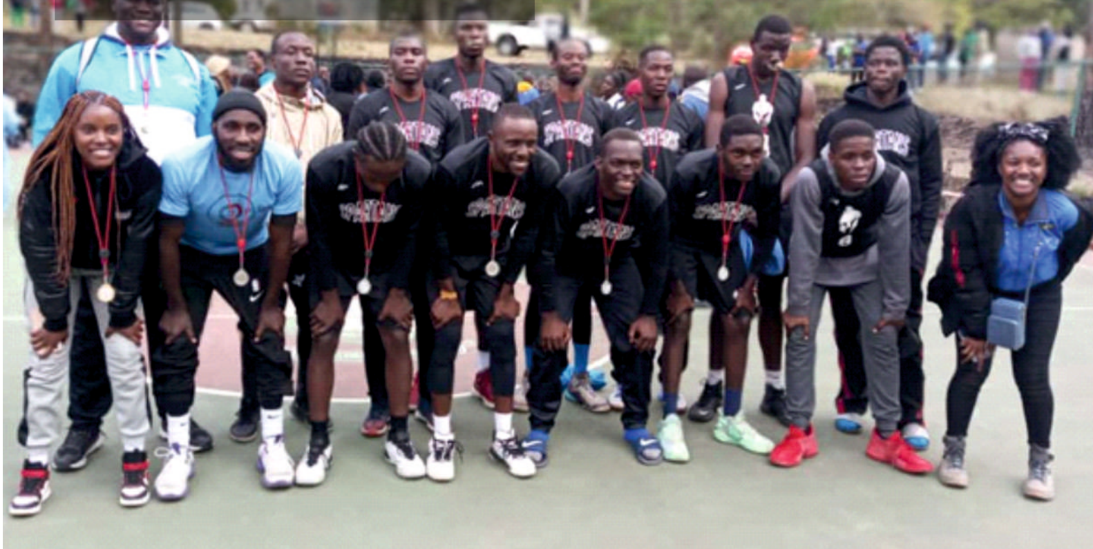
Part of the participants at the ZUSA Games

The Zimbabwe Universities Sports Association (ZUSA) massacred its opponents at the 2023 edition of the Zimbabwe Tertiary Institutions Sports Union (ZTISU) games which were held at Mutare Polytechnic from the 12th to the 16th of July 2023.