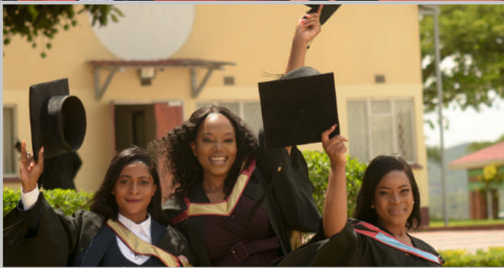
Main: Members of the academic staff in a procession. Insert: Students celebrating after graduating

Chancellor's Award of USD$1000 each which was given to the two best students (Male and Female).