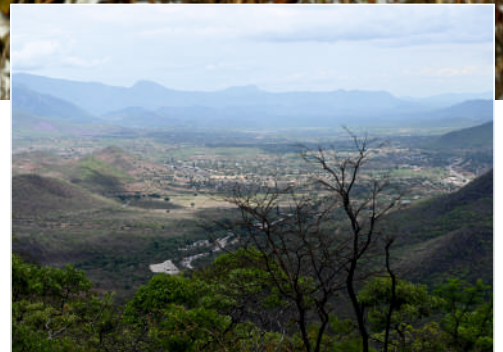
MSUAS members of staff and Friends of the Vumba hiking the scenic MSUAS escarpments

The Manicaland State University of Applied Sciences (MSUAS), Department of Tourism and Hospitality partnered the Friends of Vumba Community Trust (FOTV) in an enduring mammoth hike in mountains close to the main campus.